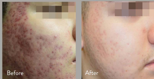
Sami Bittar, MD - Safe on Ethnic Skin