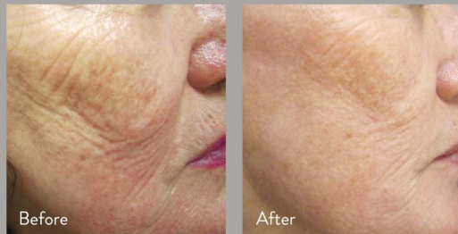
Gary Lask, MD - Skin Tightening and Texture Improvements