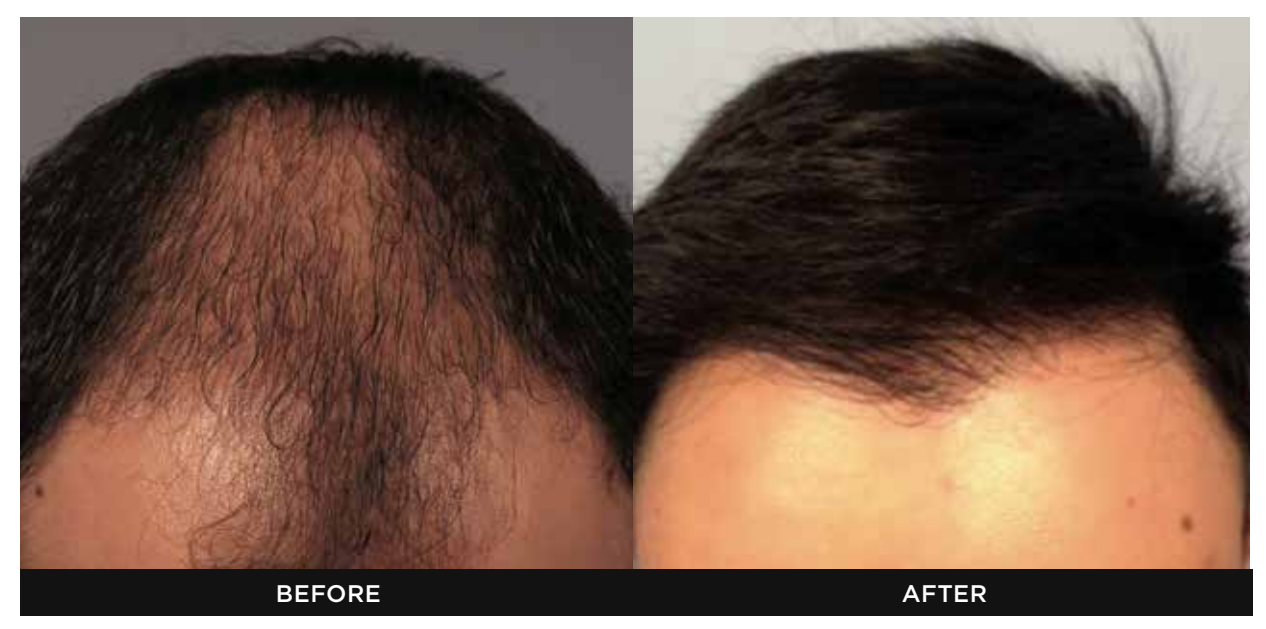
Figure 4. The use of automated and robotic FUE hair transplantation systems, such as ARTAS<sup>®</sup> and NeoGraft<sup>®</sup> is redefining the gold standard of hair transplantation. Patients can now get results without the deforming strip graft scar at the back of their donor occipital hair.

The treatment of wrinkles and lax skin has become one of the fastest growing aesthetic markets and radiofrequency (RF) energy has led the charge. The advent of fractional-radiofrequency resurfacing systems, such