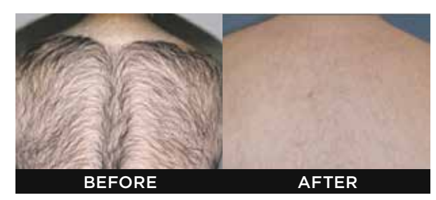
Figure 3. High-speed laser hair removal with the new generation of Diodes can remove hair very quickly-on large zones like this back in under 5 minutes-relatively painlessly and with great efficacy

The laser management of unwanted hair, remains the most commonly performed cosmetic laser procedure in the United States. Permanent reduction has now been coupled with speed and a near painless experience with the introduction into the United States of the Vectus™ high speed 810 nm diode laser, the Diolaze<sup>™</sup> 810 nm scanned diode laser and the more established Light Duet<sup>™</sup>, allowing patients with light skin and dark hair to achieve permanent reduction of large zones (e.g., a full woman's legs or a man's back) in as little as four minutes. After five treatments, permanent reduction of unwanted hair or up to 50-75 percent can be achieved. Total body laser hair removal can be performed in 30 minutes!