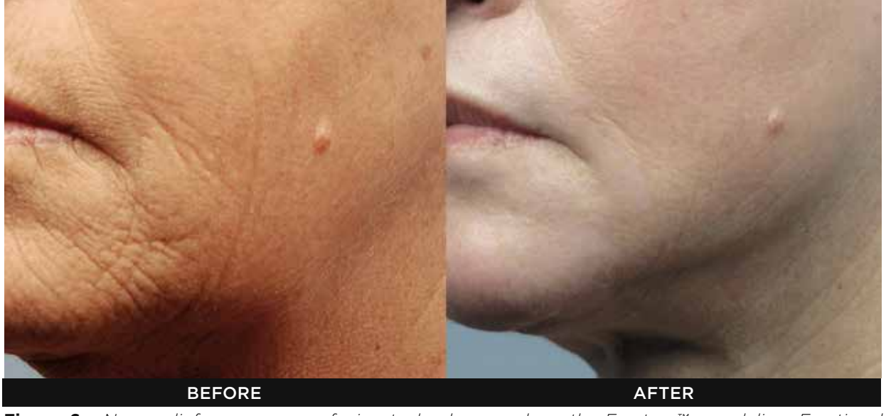
Figure 6. New radiofrequency resurfacing technology, such as the Fractora<sup>M</sup> can deliver Fractional CO<sub>2</sub> type wrinkle reduction as well as skin tightening, which can lead to very significant single treatment results for aged, sun damaged, wrinkled, and lax skin.

It is an exciting time to be an aesthetic physician and never before has the marriage of technology, dexterity and artistry been more important! New technologies have afforded aesthetic physicians the opportunity to offer their patients elegant solutions to formerly difficult to treat cosmetic problems. The total US aesthetic market has now reached a staggering $15 billion per year in procedural fees and fully 82 percent of this money is spent on nonexcisional aesthetic procedures. High tech devices and injectables are leading the way in this "aesthetic renaissance," making the access to cosmetic enhancement more democratic-no longer the domain of the uber wealthy-and allowed physicians many diverse backgrounds, most nonsurgical, to offer an array of services and compete effectively with the more traditional excisional procedures and physicians. With 83 million North American baby boomers and anticipated doubledigit growth in the aesthetic market place, it is a good time to be a doctor offering these services! 🔊