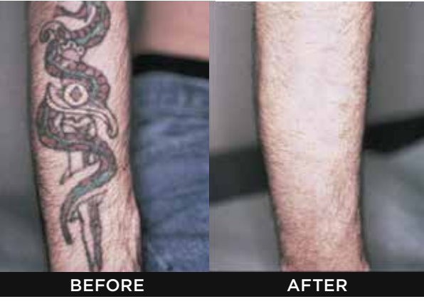
Figure 5. The Picosure<sup>™</sup> tattoo removal laser, with revolutionary picosecond pulse duration, now allows patients to get near complete recovery in half the number of treatments as existing tattoo lasers.

as the Fractora<sup>TM</sup> provide the wrinkle reduction of CO<sub>2</sub> as well as the tightening of the nonablative RF systems. These procedures are performed under topical and local anesthesia and can now take years off the appearance of the skin, with a modest degree of downtime. The advent of nonablative RF systems, such as the VenusFreeze, Exilis and the temperature controlled Forma<sup>TM</sup>, can now provide nonablative, no downtime skin tightening to be performed. Internal radiofrequency, also called "Injectable RF," has also been introduced into the US market. The product, called ThermiRF<sup>TM</sup>, uses temperature controlled, small silicone coated RF needles to deliver discrete RF energy to coagulate localized structures, such as the nerve to the glabellar corrugators for long-term reduction of frown lines.