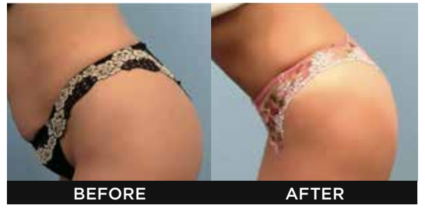
Figure 2. The use of the new UltraShape™ (HIFU), BodyFX<sup>™</sup> (Electroporation) and Zeltiq<sup>™</sup> can now permanently reduce unwanted localized fat, like the tummy and hips above, to improve contour and shape without liposuction.

appearance on the market of nonsurgical "fat killers" now allows patients the opportunity to permanently reduce 11/2 inches (4 cm) or more of localized unwanted fat without a painful surgical procedure. Zeltiq<sup>™</sup> or Coolsculpting<sup>™</sup>, which freezes localized fat of the abdomen and hips, was one of the first technologies to enter the US market. Most recently, the painless UltraShape<sup>™</sup>, which uses gentle, pulsed, focused high frequency ultrasound waves to melt fat of the tummy, hips and outer thighs, was also approved, as was the BodyFx<sup>™</sup>, which uses high voltage electrical current to accomplish the same goals. Most successful practices will use one, or increasingly a combination or two of more of these technologies, to shape the figures of