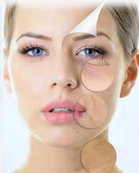
Deep cleansing & heath whitening