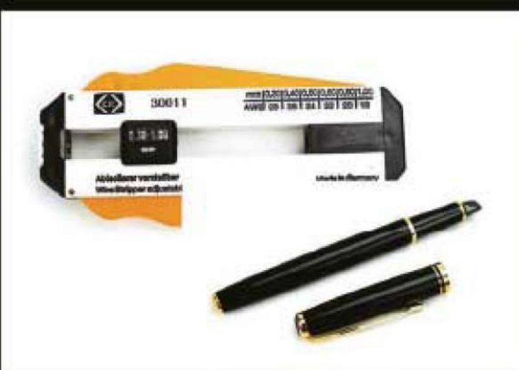
Fiber Stripper & Cutter