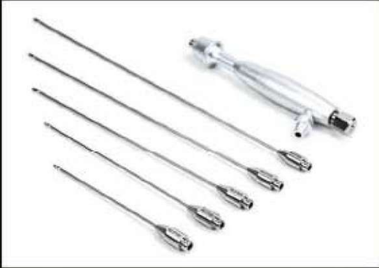
Lipo Handpiece Pro Length: 100mm,150mm,200mm, 250mm,300mm

Global collaboration, Compliant with CE/FDA Certification. We can assist in finding the latest manufacturers for your needs