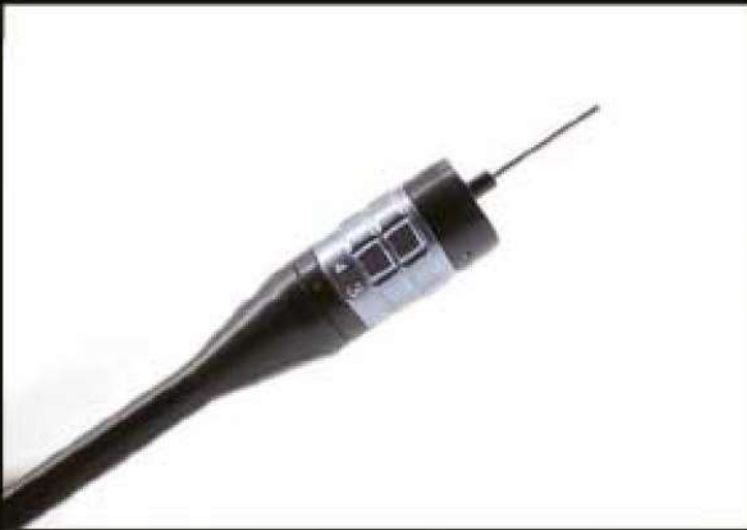
Zooming Handpiece (450nm)